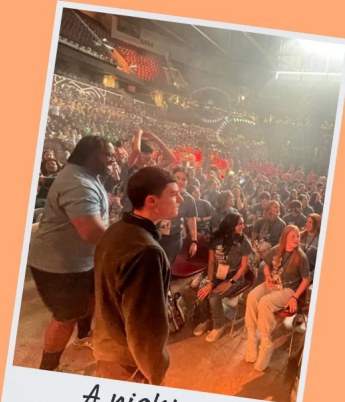
A night at Steubenville South

$50 DEPOSIT & REGISTRATION IS DUE TO SACRED HEART CHURCH OFFICE BY MARCH 5TH SPACE IS LIMITED!!