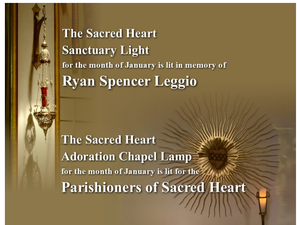
The Sacred Heart Sanctuary Light for the month of January is lit in memory of Ryan Spencer Leggio