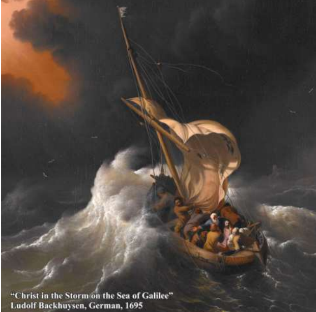
"Christ in the Storm on the Sea of Galilee" Ludolf Backhuysen, German, 1695

O God, Master of this passing world, hear the humble voices of Your children. The Sea of Galilee obeyed Your Son's command when He calmed the stormy waters and delivered the disciples from fear and harm.