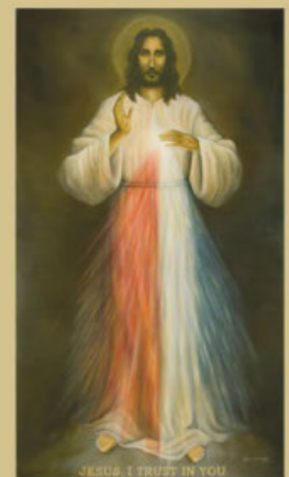
Divine Mercy Portrait Sacred Heart of Jesus Church east transept - oil on canvas by Katherine Borgatti © 2019