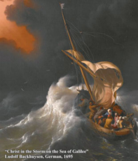
"Christ in the Storm on the Sea of Galilee" Ludolf Backhuysen, German, 1695

O God, Master of this passing world, hear the humble voices of Your children. The Sea of Galilee obeyed Your Son's command when He calmed the stormy waters and delivered the disciples from fear and harm.